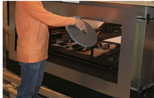
Figure 4: Install silicone gasket

STEP 4: Attach the stainless steel frame (Fig. 1, Part No. IOSK6-A01) to the galvanized frame lining up the holes around perimeter. Secure in place through holes across the top and down the sides. Do not secure the bottom flange.