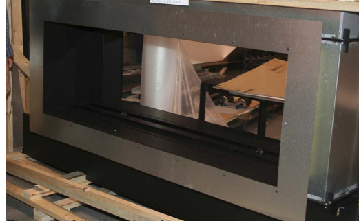
Figure 3: Attach galvanized apron to unit

STEP 3: Install the silicon gasket material (supplied by Montigo) in one continuous strip with the joint at the bottom, Figure 4.