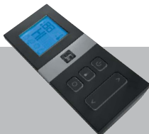
WALL REMOTE REC1493