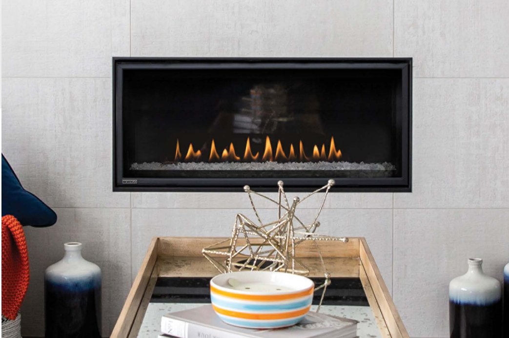
MONTIGO / DELRAY / LINEAR / DRL3613NI-2 / ICE FIREGLASS