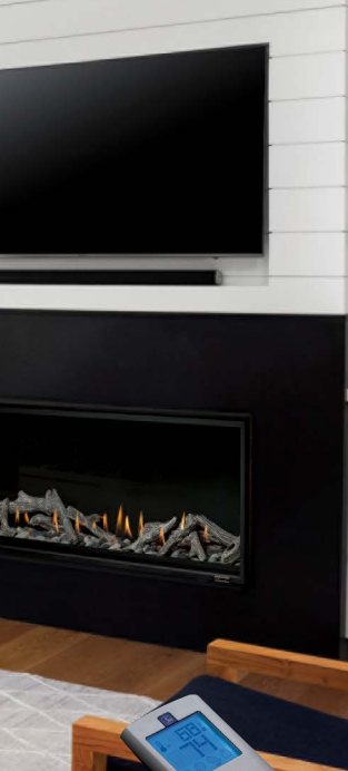
MONTIGO / DELRAY / LINEAR / DRL3613NI-2 / DRIFTWOOD SPECKLED STONES