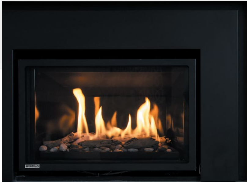
MONTIGO / ILLUME / 30FID / CONTEMPORARY