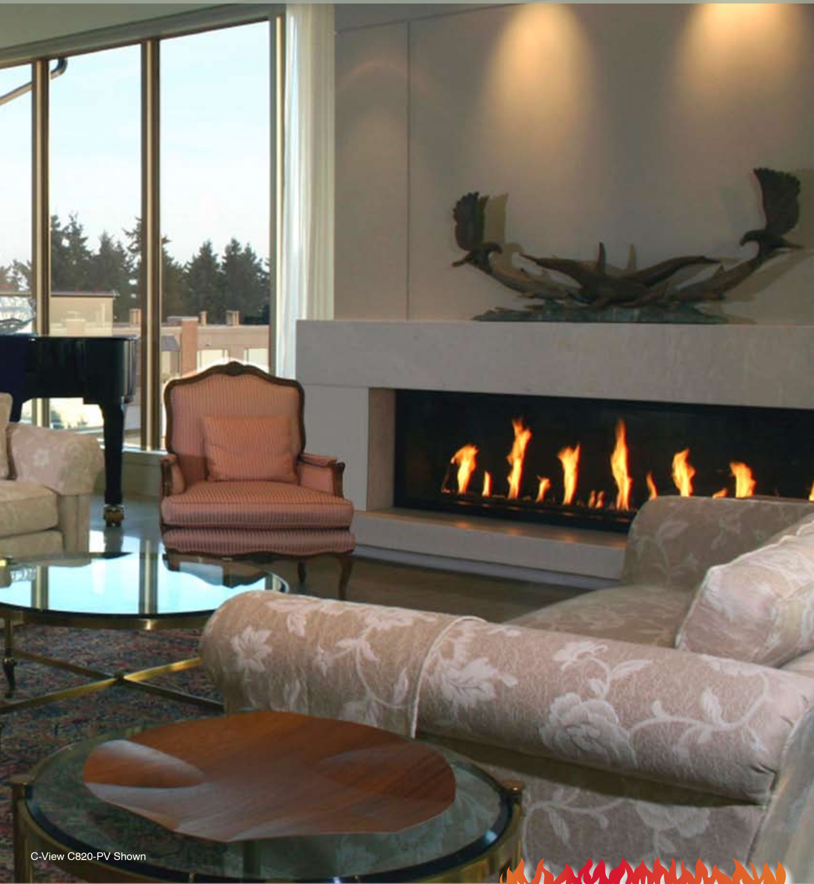
C-View C820-PV Shown

an experienced leader in the gas fireplace industry